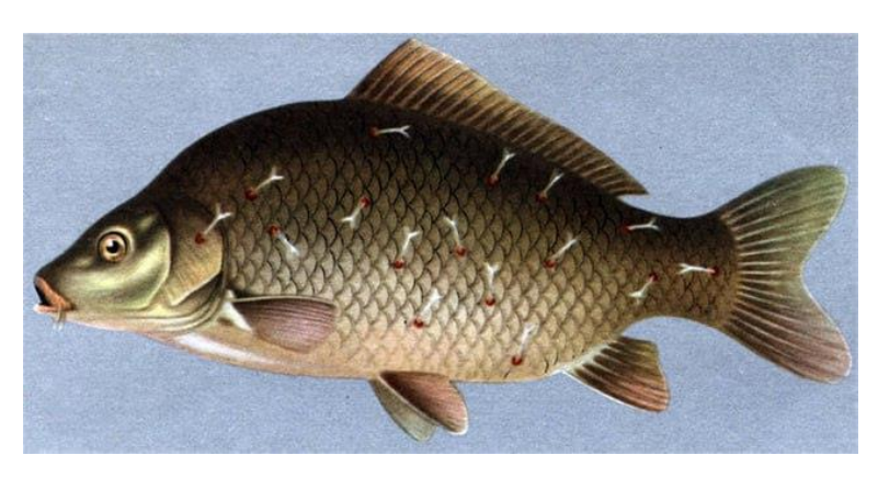
Figure 2. Appearance of lerneas on the outside and on the body of a fish.

It is advisable to clear the area around the basin from trees, bushes, and reeds, because such measures should be carried out in order to keep the main hosts of many parasitic diseases (molluscs, birds) away from the area around the basin. In addition, for the purpose of filtering water for receiving water in the basin, "otstoynik" basins, that is, a basin that stops and cleans the stagnant water. These ponds serve to clean up to 70%