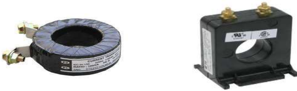
Figure 5: Current transformers of various shapes

To create a single-turn primary winding, circuit cables can be fed through the centre of an opening in the core of a window-type current transformer. The aperture's centre is where the principal conductor should be positioned for optimal precision. The primary-to-secondary current ratio is used to classify CTs. Switchgear manufacturers and users have different preferences for form factor. Current transformers for low voltage single-ratio metering typically have plastic-molded casings or are ring-type. Current transformers with a split core either have a removable component of the core or a core that is split in two [134]. This permits the transformer to be quietly installed around a conductor. Low-current measurement equipment, often handheld, battery-operated, and portable, make extensive use of split-core current transformers (see illustration lower left). The protective relays are supplied with currents that are proportional to the currents in the power circuit, but are amplified by current transformers. The instruments for measurement must be isolated from the high power sources. Therefore, current transformers provide that equipment with currents of appropriate magnitude relative to the applied power [135].