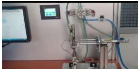
Figure 8: working module