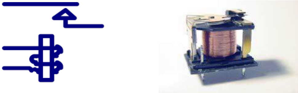
Figure 7: A relay and its contacts

rather than a person, flips the switch from the off to the on position in an electrical switch. Relays can be discovered tucked away in all kinds of unexpected places. Relays were utilised to implement Boolean gates in the earliest computers. Turning on a relay requires only a little amount of electricity, but the device it controls may require much more. For instance, your home's air conditioner may be controlled by a relay. The air conditioner is likely powered by 220VAC at 30A. The relay's control coil may only require a few watts of power in order to close the connections (fig.7).