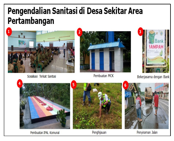
Fig 4. Realization of the Circle Mine Escape Program (In Indonesia)