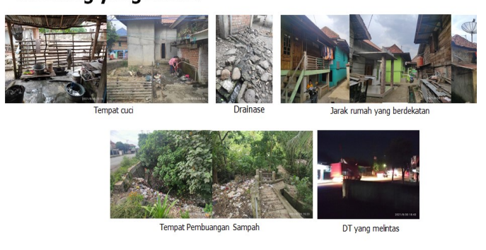
Fig 3. Poor Sanitation in Mine Circumference (In Indonesia)

© 2021, CAJOTAS, Central Asian Studies, All Rights Reserved