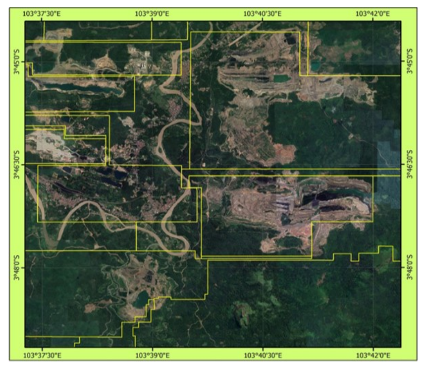
Fig 1. Map of IUP Lahat

With an area of 4,361.83 km<sup>2</sup> Lahat Regency. The largest sub-district is the East Kikim sub-district with an area of 564.45 km<sup>2</sup> or about 13% of the total area of Lahat Regency, while the sub-district with the smallest area is Muara Payang sub-district with an area of 37.50 km<sup>2</sup> or about 0.8% of the total area of Lahat Regency. The results of the implementation of social mapping, it is divided into two parts, the first is the search for primary village profile data from sub-district data, village office data, to find out village monographs and village potentials. The second part is a "NEEDS ASSESSMENT" survey with a questionnaire to find out the wishes. This technique uses deep interviews and interviews (face to face) with several community leaders and ordinary community members who are considered to represent the overall aspirations of the village community by providing a list of questions compiled in questionnaires and conducting structured interviews guided by enumerators in charge of recording the answers from the information sources. The location of the IUP can be seen in Fig 1 below.