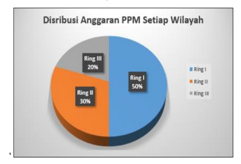
Fig 2. PPM Ring I, II, III Cost Sharing (In Indonesia)

The ring area is an area that is directly affected by mining operations and the location of the company's main facilities, where the community has a high frequency of contact with the company. The scope is one or several villages, sub-districts, and districts whose areas or areas of livelihood are directly affected by company activities, both environmental and social impacts based on baseline studies and Environmental Impact Analysis. To receive optimal benefits from program implementation, the company has classified the area boundaries based on the locations directly affected.