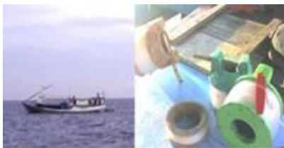
Figure 4. Fishing Rod Unit

In principle, the fishing line used consists of a long rope, a fishing line without a ballast. This fishing rod generally uses artificial bait / fake bait. The artificial bait can be made of chicken feathers, attractive colored fabrics or plastic materials in miniature to resemble the real thing (eg squid, fish, etc.).