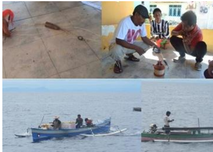
Figure 1. Line Fishing Unit

In principle, the fishing line used consists of a long rope, a fishing line without a ballast. This fishing rod generally uses artificial bait / fake bait. The artificial bait can be made of chicken feathers, attractive colored fabrics or plastic materials in miniature to resemble the real thing (eg squid, fish, etc.).