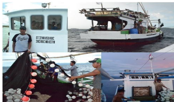
Figure 2. Purse Seine Ship Unit

The coastal areas of Kwandang Port and Gentumana Raya are fishing base areas as well as fishing ports for Lampara/Mini Purse Seine vessels in the waters of the Sulawesi Sea with specifications as shown in (Figure 2). These activities include: preparation before the ship departs, the method of catching and handling the catch.