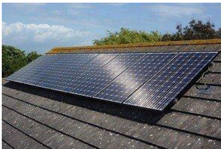
Where to install

In recent years, alternative, renewable energy sources are gaining more and more popularity, among which solar energy stands apart. This source of energy is good because it is inexhaustible for at least another 5 billion years.