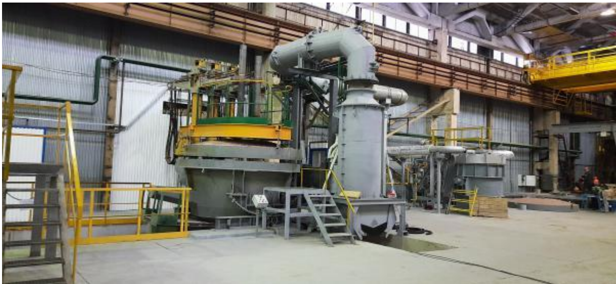
1 – picture. 30 ton electric arc furnace

A 30 – ton electric arc furnace was used to produce reinforcement products from high – quality steel alloys. One of the most important priorities of electric arc furnace liquefaction is to obtain quality castings.